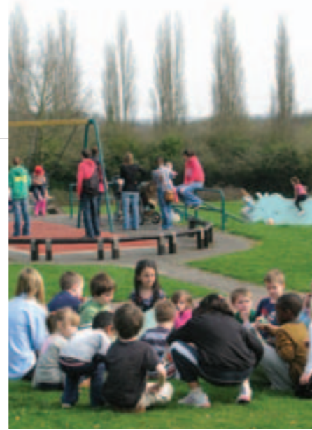
ABOVE: Children enjoying some fresh air at Downhead Park play area.

For less than £3 a month for a Band D household, we hope you will agree that this is pretty good value!